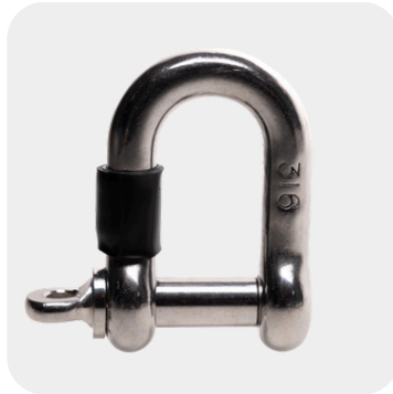
✓ Heatshrink over round surface