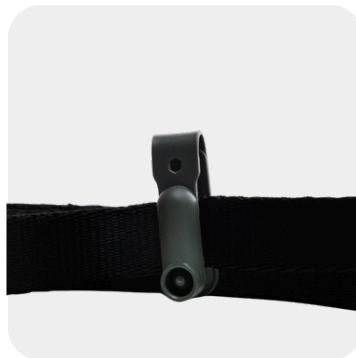
✓ 1" / 25 mm Webbing